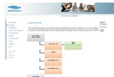
Fig. 5 - Learning Path