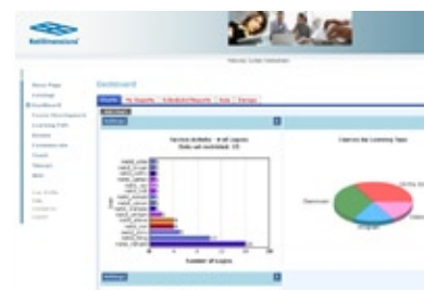
Fig. 3 - Dashboard Page