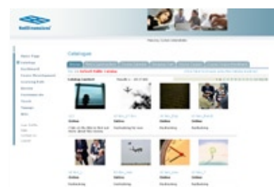
Fig. 4 - Catalog Content