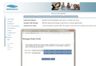
Fig. 2 - Assessment Engine